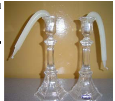
This what happened to two of our candles that sit in our living room.

Unlike these candles, we are not stuck in the position that results from our circumstances. We are bendable and shapeable by the Lord who always comes at the right time and meets us with the breakthrough that we need. We must never give up or give in too easily because when we do we miss the opportunity for God to stand us back up.